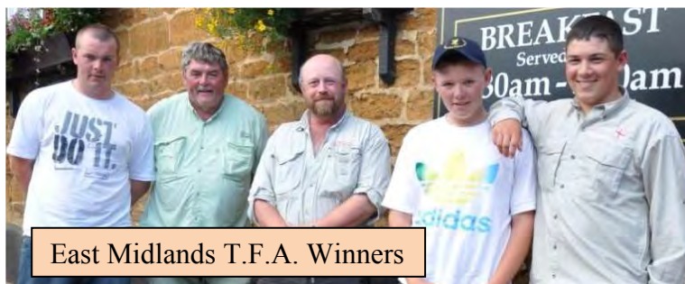
East Midlands T.F.A. Winners