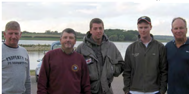
Hanningfield F.A. - Winners

The fishing boats had to concentrate on the margins of the shoal of fish. For most,