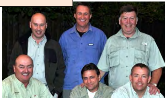
England Police F.F.A.

Outside the lodge booms and towards the sailing club fish were rising steadily to these throughout the day. Rods were seen to bend every so often to nymphs on floating and sink tip lines. A windless few hours and dead air during the early afternoon showed the green algae to be quite heavy although a little breeze later on helped fly presentation and boat drift.