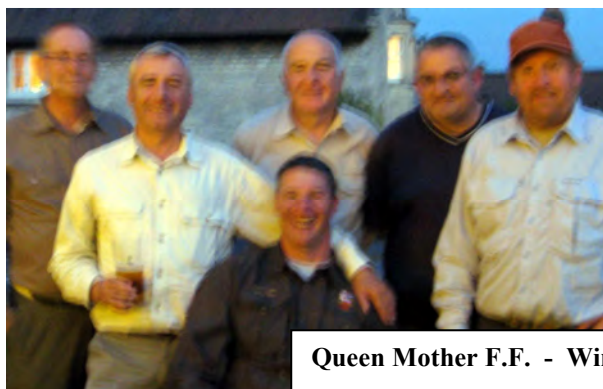
Queen Mother F.F. - Winners