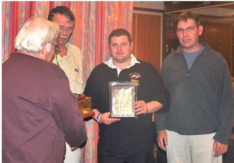
Fish Hawks 'B' WINNERS Group Three