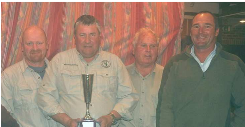
Tunbridge Wells F.F.S. WINNERS Group Three