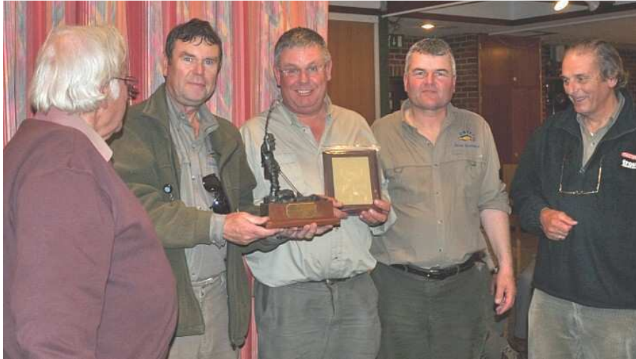
Grafham Water F.F.A. WINNERS Group Two